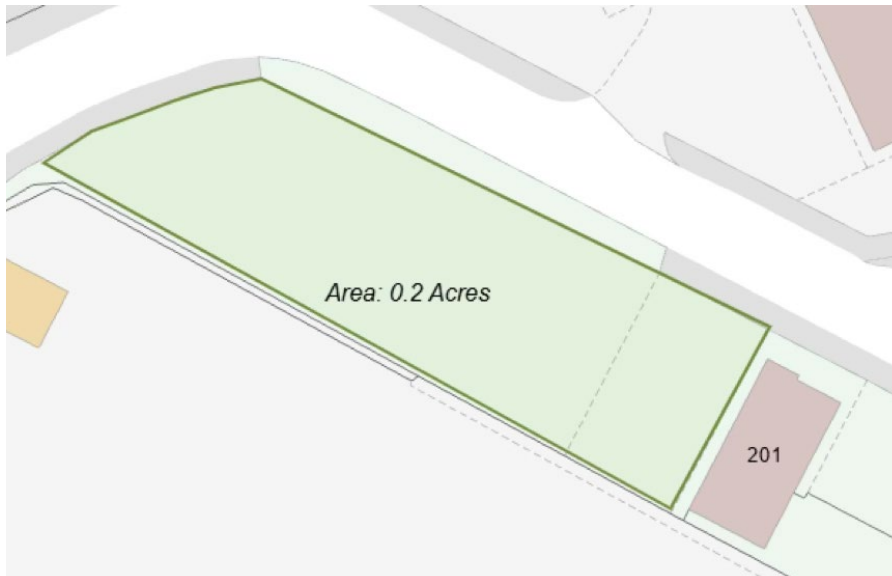
For indicative purposes only.